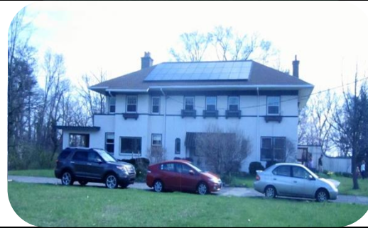
Meeting House with solar panels

https://www.quakercloud.org/cloud/community-friends-meeting