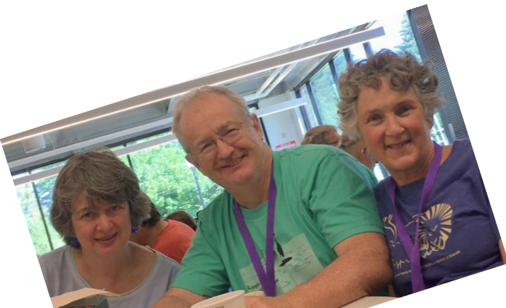
Photos from Friends General Conference Gathering at Niagara University in New York