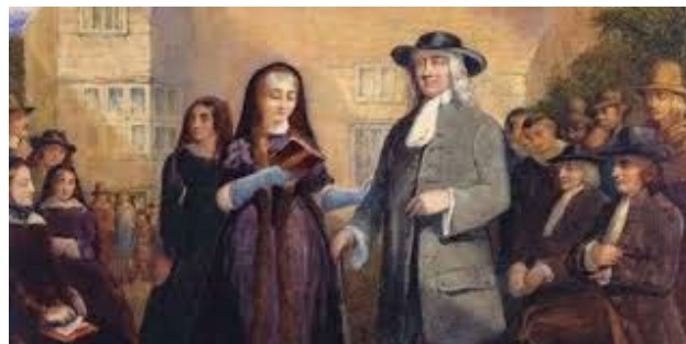
Margaret Fell and George Fox at Swarthmore