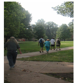
-Walking to worship sharing at OVYM Annual Sessions 2003

Register now at: https://www.ovym.org/events/2021-annual-sessions/