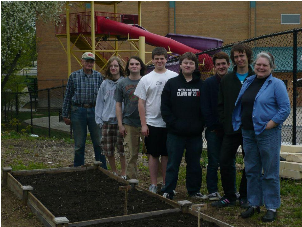
Photo of Ohio Valley Yearly Meeting teen group and Friendly Adult Presences who worked to build a raised bed garden at Gabriel's Place in Avondale.