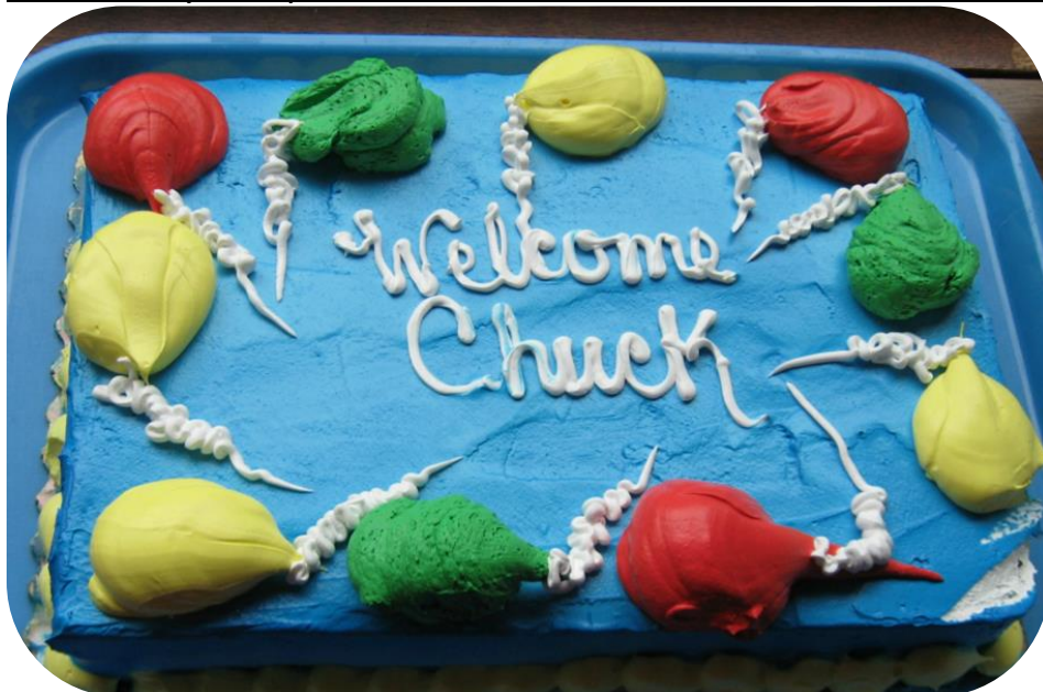
Cake at Chuck Moore's welcoming party on May 2