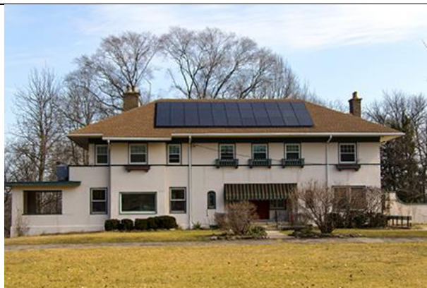
of Meeting House with solar panels

www.communityfriendsmeeting.org https://www.quakercloud.org/cloud/community-friends-meeting