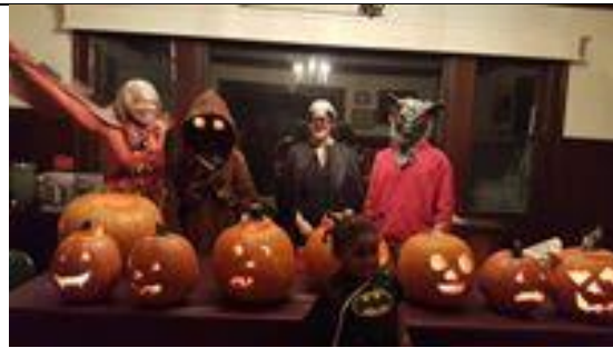
Harvest Fest

https://www.quakercloud.org/cloud/community-friends-meeting